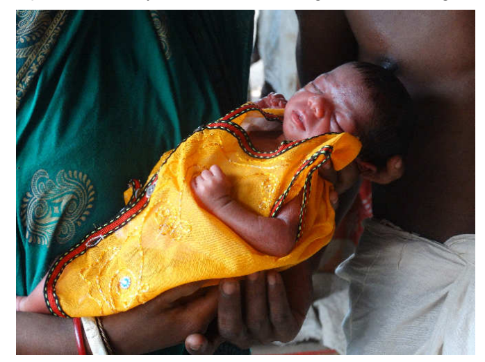
and that we would have to improve her nutrition quickly. I prayed this little one would live for she was so small.

I saw how weak and listless the baby was, and asked what they had been feeding her. They said, "cow's milk." I suspected that they had not been feeding her often enough,