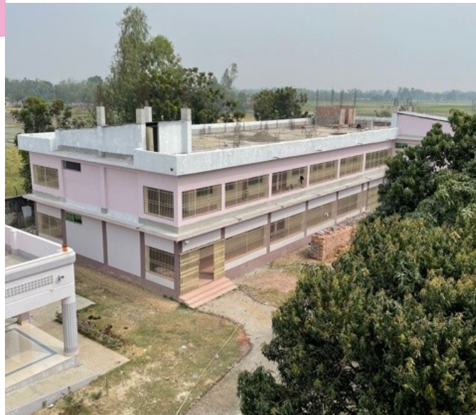
Our new, two-story Girls' Dormitory

Thank you for your continued support. Please mark donations toward this project "Girls' Dorm".