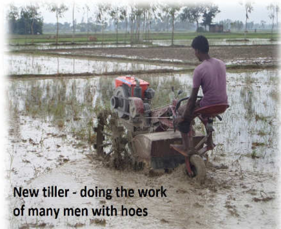
New tiller - doing the work of many men with hoes